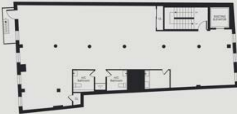
SECOND TO FOURTH FLOOR