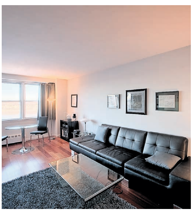
Minimalist modern furnishings enhance the sense of space in the living area.