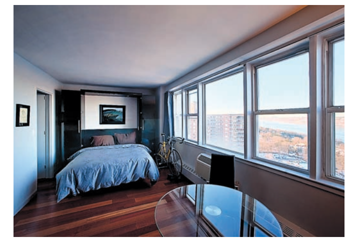
The sleeping alcove houses a queen-sized bed that folds away into the wall and shares a ribbon of windows with the living area.