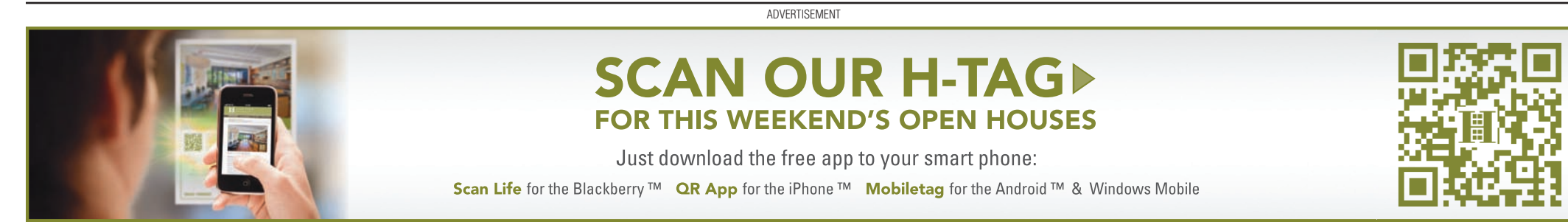
Note: Each week's featured home is chosen at random from among houses and apartments offered by Riverdale Press advertisers. The opinions expressed are those of the advertiser and not The Riverdale Press news department. For further information, write to advertising@ riverdalepress.com.

The abundantly equipped gourmet kitchen is unusual for a studio, above.