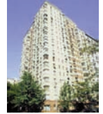
565 West End Avenue