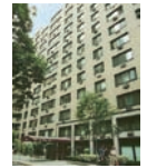
16 West 16th Street