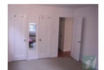
35-44 75th Street

Live-in superintendent, laundry and bicycle rooms. Ten minutes to Manhattan via subway located 1½ blocks away and steps to shopping. Web ID # 605142