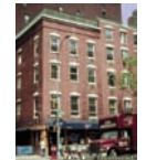
151 East 20th Street

Low-rise elevator building, voice intercom. Small pets allowed. WEB ID # 5603850