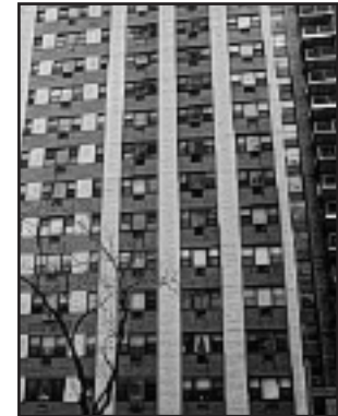
446 East 86th Street

Full-service doorman building with laundry room, storage and bike room. Pet friendly.