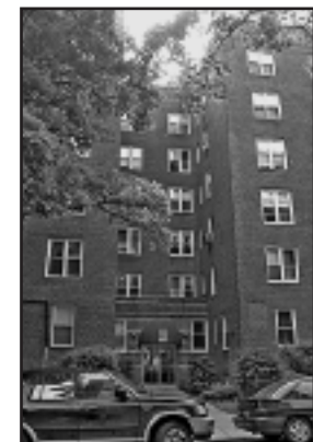
143 Bennett Avenue

Located in a fantastic Washington Heights neighborhood close to shopping, public transportation and Fort Tryon Park. Live-in superintendent, laundry room, voice intercom.