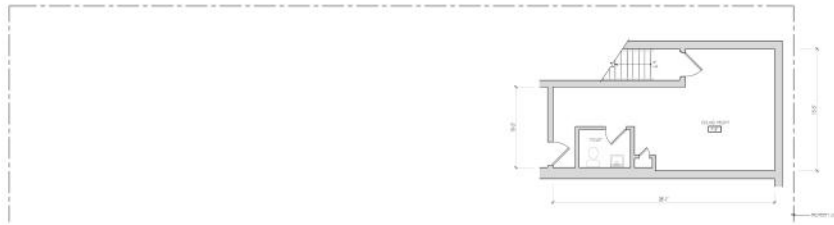
CELLAR PLAN AD157