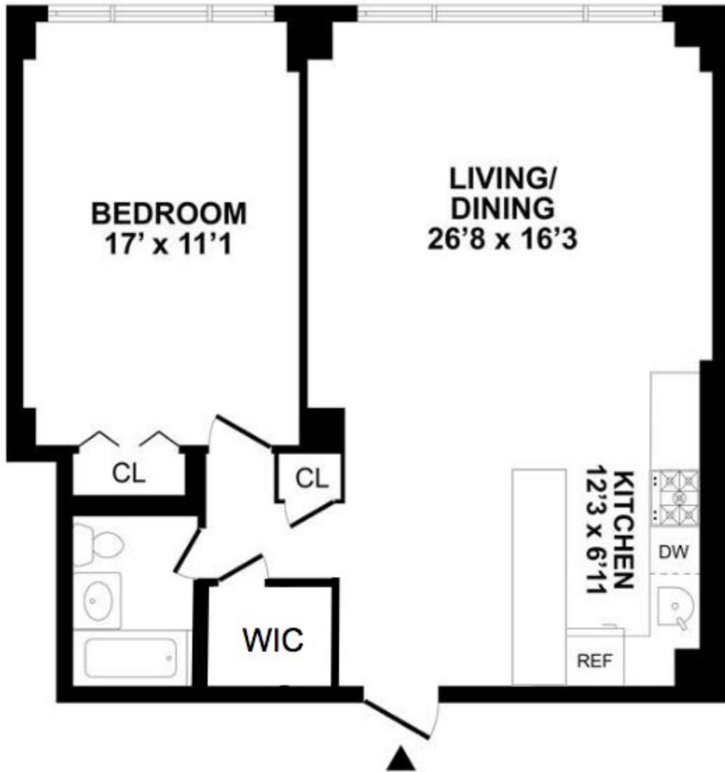
400 EAST 85TH STREET, APT 7G FLOOR PLAN FOR IDENTIFICATION PURPOSES ONLY - NOT TO SCALE