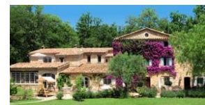
(Plascassier stone Bastid former home