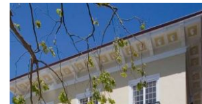
(San Francis San Francisc Mansion