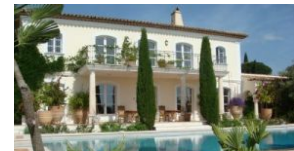
(Grimaud, ) L Proven