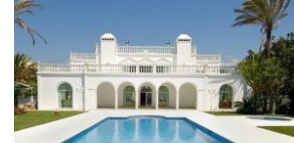
(, Barcelona) in Marbella S