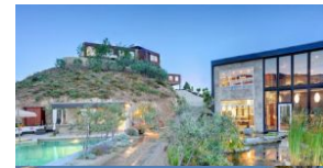
(Malibu, Calif) Ocean View | For Sale