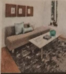
Columbia Street, Brooklyn: $2.35M

Bedrooms: 3 Bathrooms: 3 Square feet: 1,781 Common charges: $851 A "strikingly attractive" new condo in a "special" nabe, the Columbia Street Waterfront District, with "modern" amenities and "magnificent" views of the Manhattan skyline. Agent: Doug Perison, RealDirect, 646-783-8760