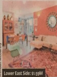
Lower East Side: $1.59M

Bedrooms: 3 Bathrooms: 3 Square feet: 1,781 Common charges: $851 A "strikingly attractive" new condo in a "special" nabe, the Columbia Street Waterfront District, with "modern" amenities and "magnificent" views of the Manhattan skyline. Agent: Doug Perison, RealDirect, 646-783-8760